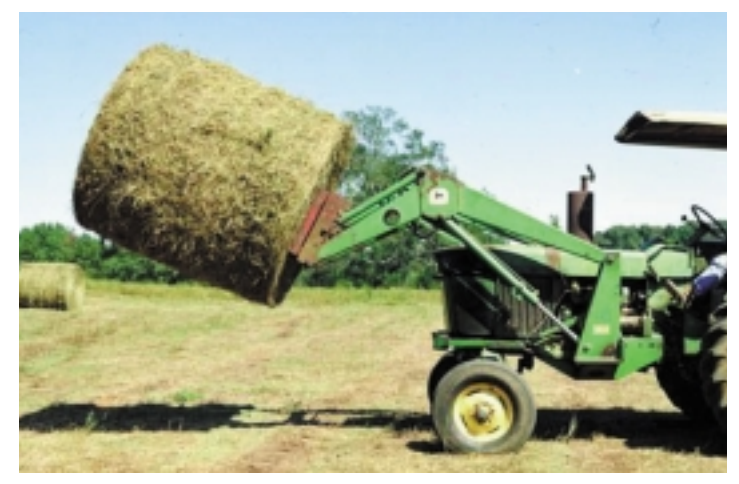
In a deregulated market, power producers with coal generation may use biomass cofiring to improve their overall environmental performance for customers who are sensitive to environmental issues.

Biomass cofiring may represent an opportunity for both consumers and power companies. In recent polls, consumers have indicated their willingness to support greenpricing and renewable energy programs. Some consumers are paying a premium for renewable energy, typically 10% or less of their entire bill. For power generators, biomass may represent the most plentiful and economic supply of locally available renewable energy.